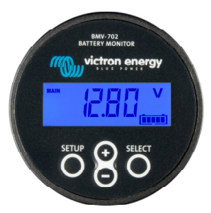
BMV 702 Black